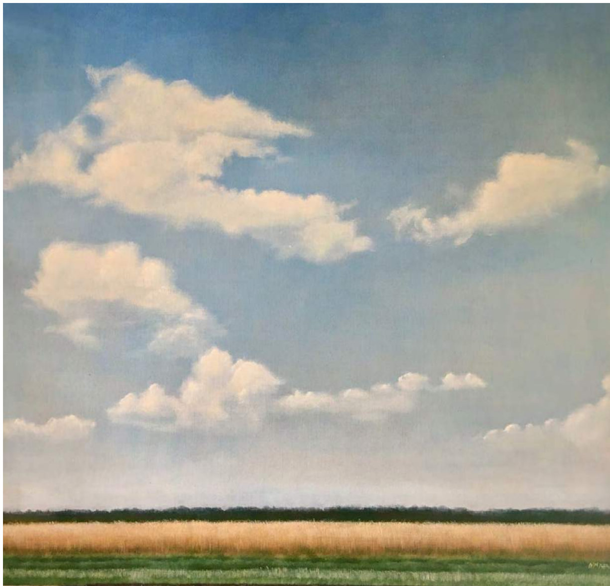
FIELD ON BIG CREEK RD.