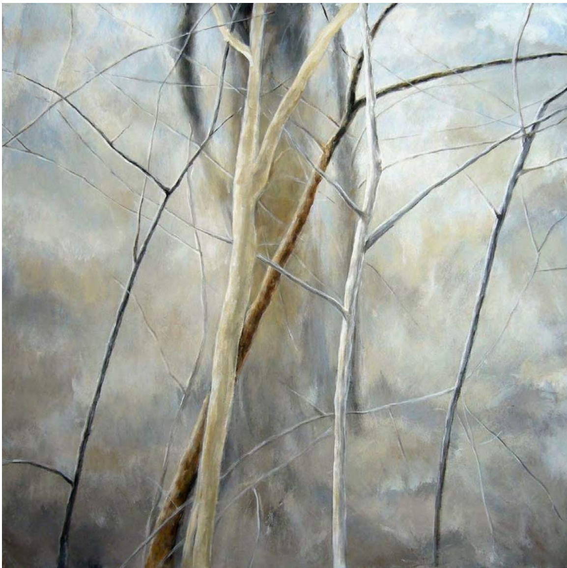
WINTER TREES IN GREENE