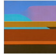
Judy Barber Big Blend (1973) Acrylic 52 in x 52 in