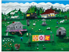
Mary Green The Express Acrylic 18 in x 24 in