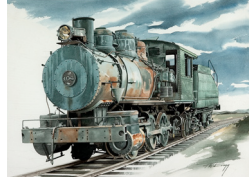
Robert Bragg 10-4. Over and Out (1978) Watercolor 17 1/2 in x 23 1/2 in