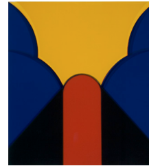
Erwin Erickson Green Mountain Sunrise (1971) Print (silkscreen) 30 in x 27 1/2 in