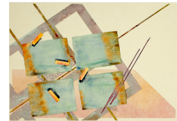
Alan Vaughn New Games 1 (1987) Watercolor 18 in x 24 in