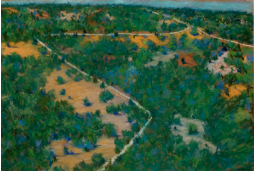
Steven Steinman Pine Valley (1987) Pastel 19 1/2 in x 28 1/2 in