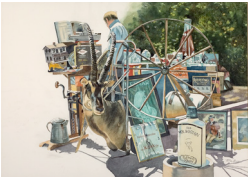
Eve Bragg Johnny's Too Long at the Fair (1973) Watercolor 21 in x 29 in