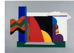
Lev T. Mills Prelude (1981) Print 24 in x 33 in