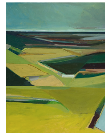
Michael Junkin Bolinas 3 Oil 50 in x 40 in