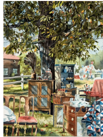
Eve Bragg Crabapple Fair (1973) Watercolor 30 in x 24 in