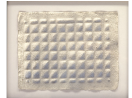
Florence Swindell Mitchell Grid II (1974) Mixed Media 10 in x 13 in