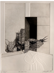
Dick Bearsley The Door #2 Print (Etching) 13 1/2 in x 10 1/2 in