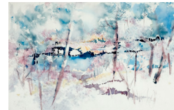
Gena Oldham Genesis: The River of Eden (1980) Watercolor 28 in x 43 in