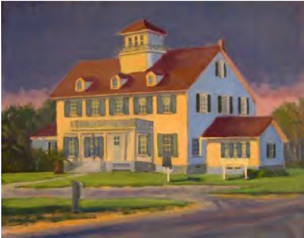
THE OLD COAST GUARD STATION - ST. SIMONS ISLAND