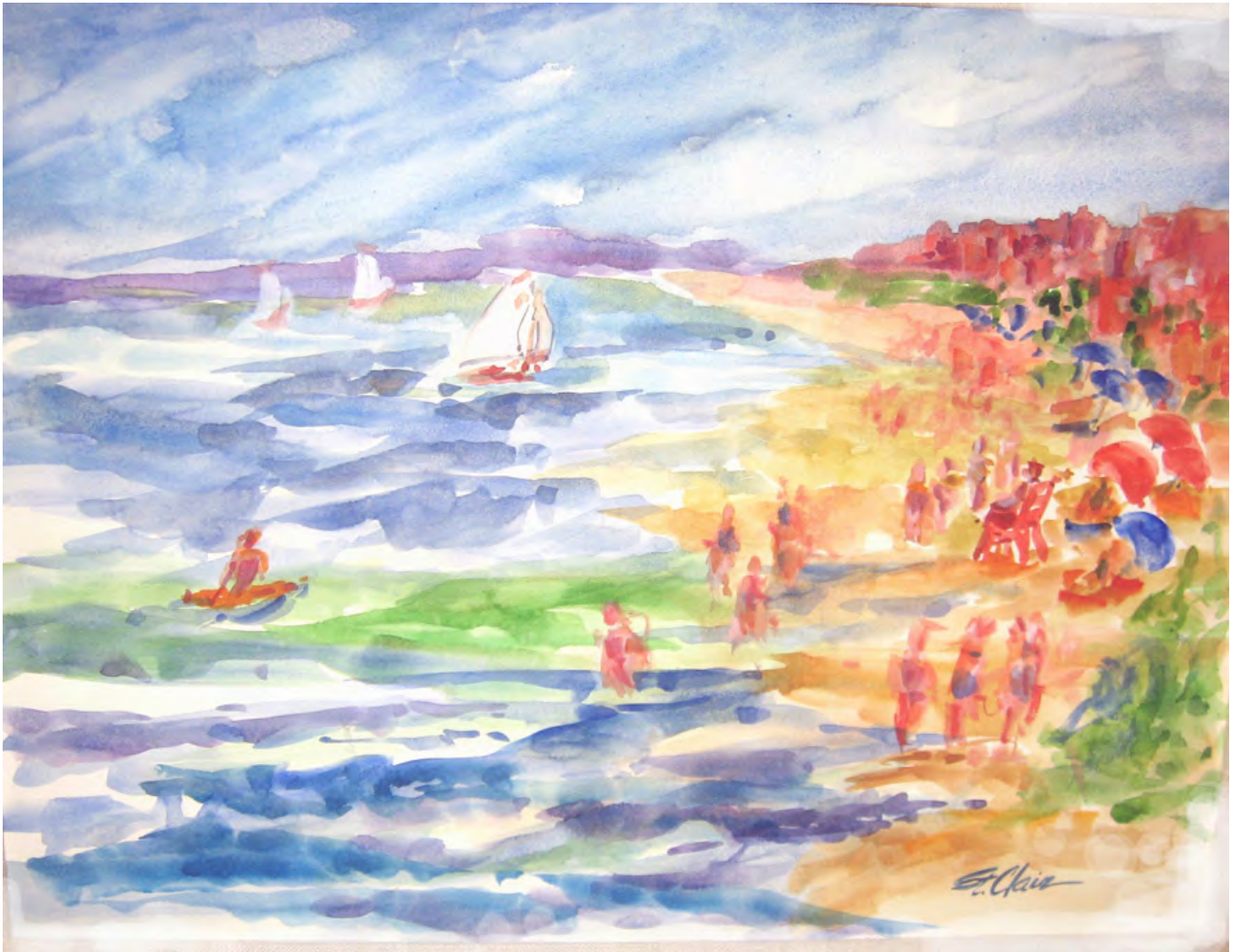
EAST BEACH ST. SIMONS ISLAND (2016)