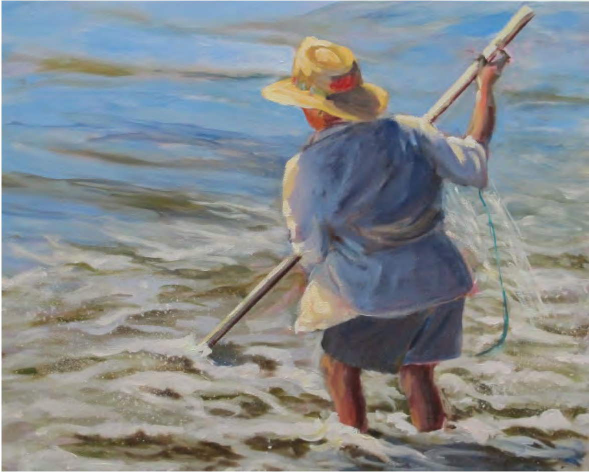
PULLING THE NET (2015) Oil • 16 x 20