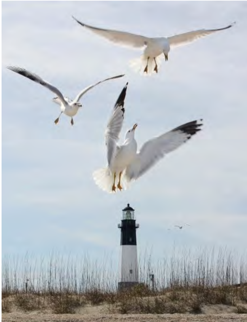
THE TYBEE DANCE Digital Photograph